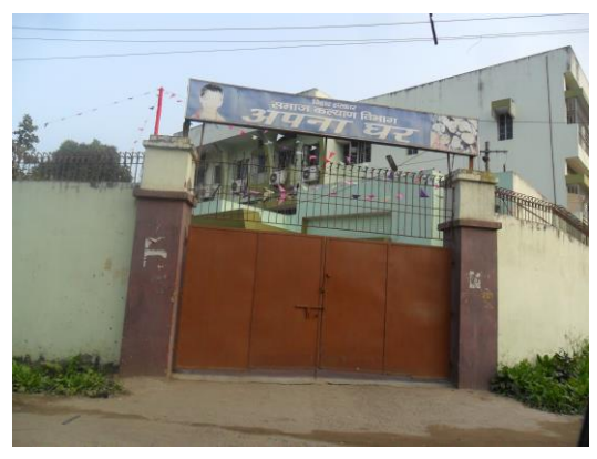
Apnaghar – Government Boys Shelter Home, Patna

Child Care Institutions or CCIs such as Care Homes are very few in Bihar. There are 3 Government Run Homes and few NGO Run