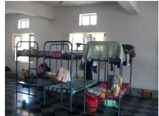
Inside one of the Care homes

assessment would enable us in selecting the partner organizations that could be provided capacity building for quality care and support to children infected and affected by HIV and those vulnerable to it. The visits were made from 4<sup>th</sup> March to 9<sup>th</sup> March.