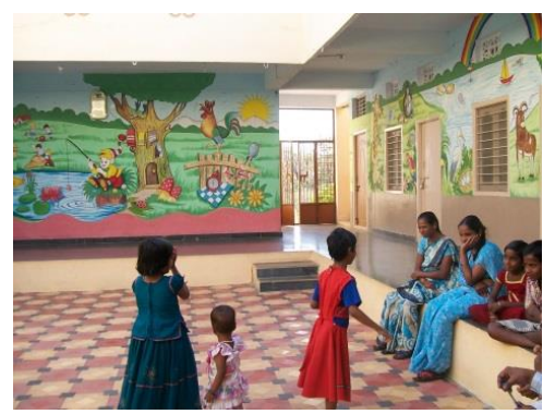
A Care Home

As part of the Institutional Capacity Building to Enhance Care and Support for Children